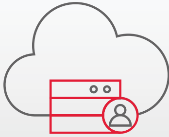
Esri Geospatial Cloud